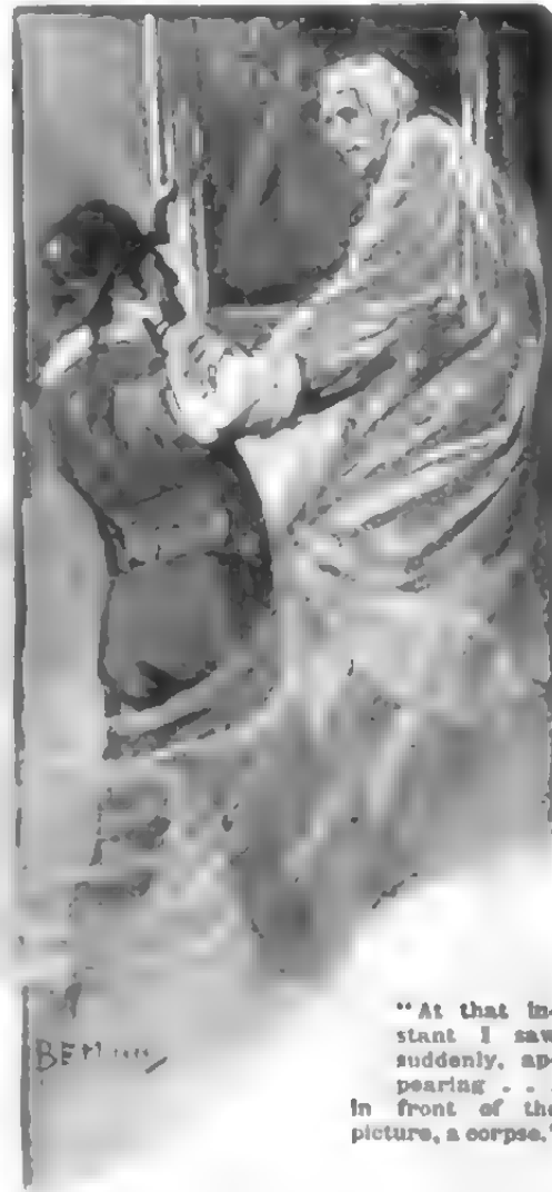
"At that instant I saw suddenly, appearing . . . in front of the picture, a corpse."

"Two men came into the room, and moved about. I could not see what they were doing. Presently, one of them, who was in his shirt-sleeves, and looked like a work-